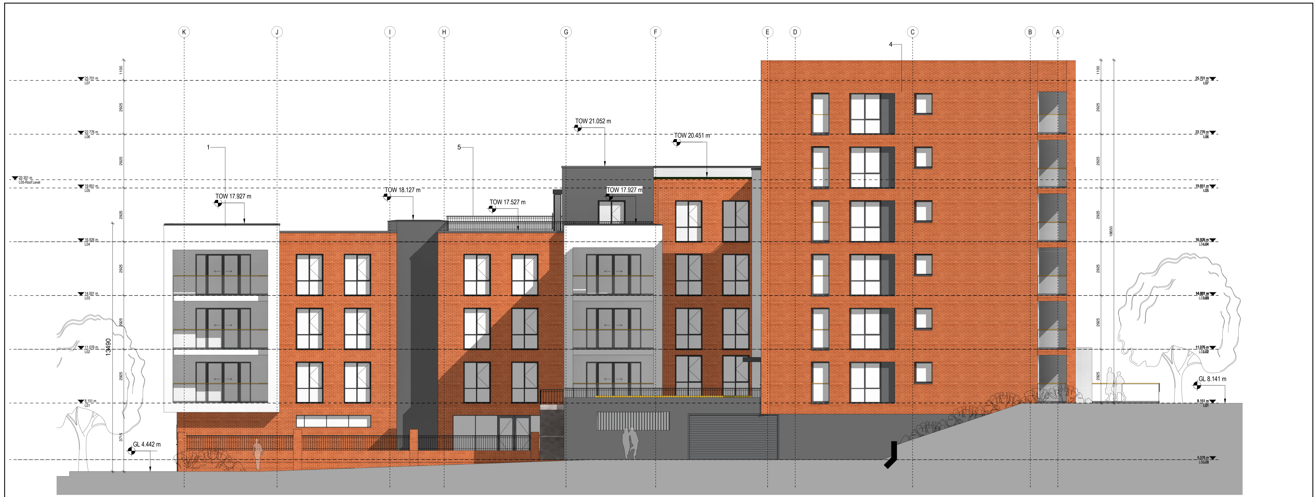
1 ELEVATION.C 1 : 100 @A1