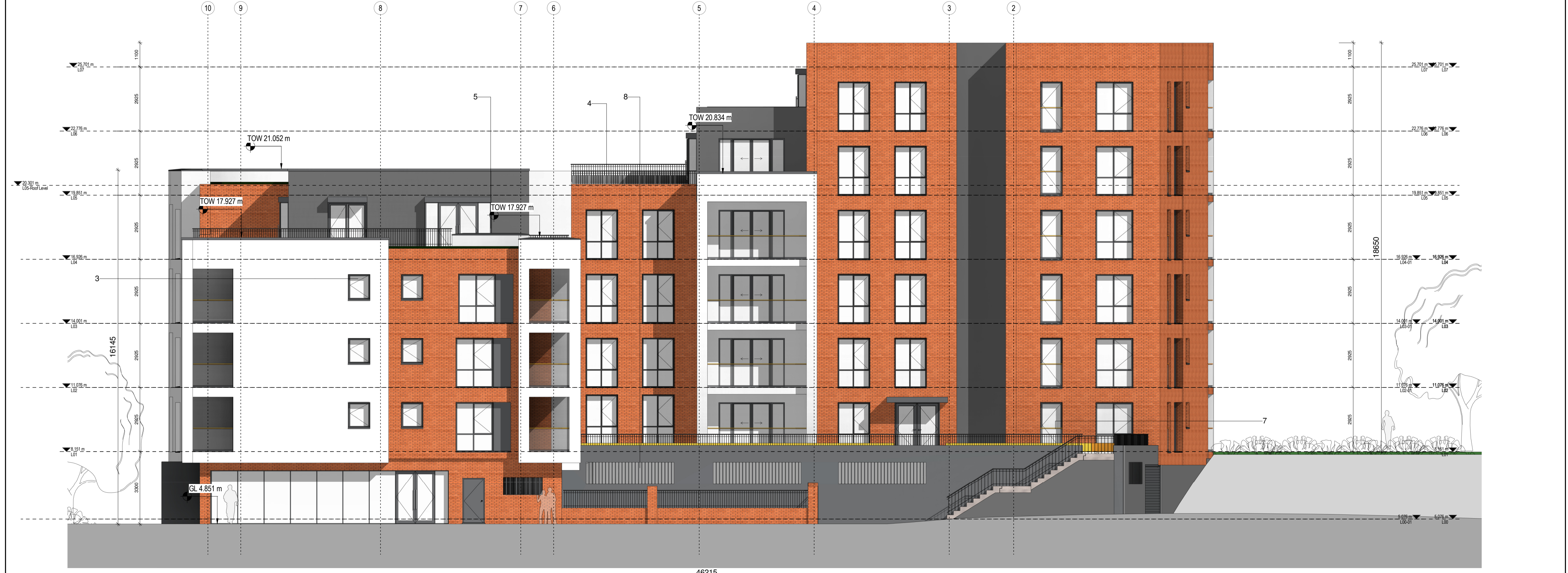
2 ELEVATION.D 1 : 100 @A1